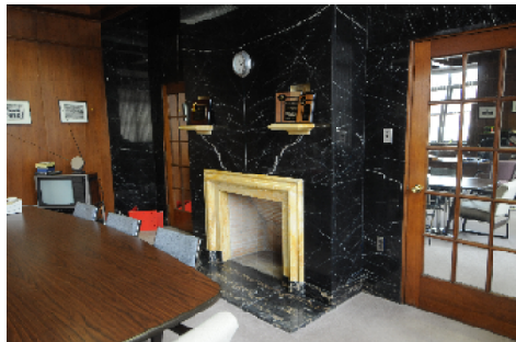
Unique Original Art Deco Character