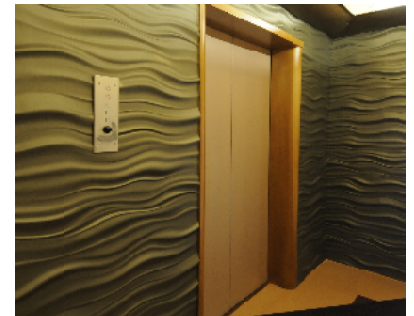
Interesting Details Throughout